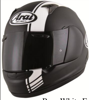
Base White Frost